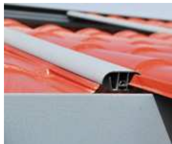
Panel Sliding System

Ready to assemble - pre-drilled profiles, pre-cut panels, all screws included. No heavy parts - safe easy frame assembly.