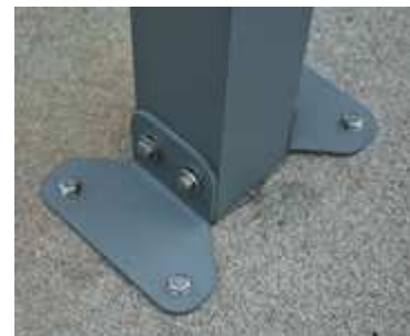
Anchoring Kit Included

No glazing connectors are needed. No Roof climbing is needed - safe & easy fit panels slide on from lower roof end.